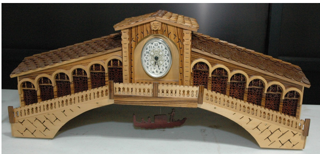
Build A Clock

All the artwork shown in this brochure was made by our OCSSA members.