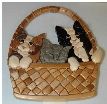
A Basket Of Cats